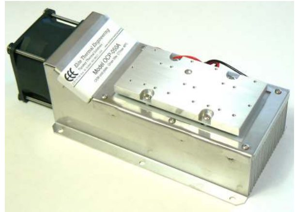
Figure 1 below outlines the functional hole patterns. It has two locations for CS mounts ---- the one in the front is for easily using it for free-space laser systems, and the middle one is for fiber coupled packaged CS diode bars or multiple lower power diodes. The 4 flanges on top of heatsink are designed for mounting to optical table with 1/2" posts. Custom mounting holes patterns is available upon request.

OCP-055 is a high performance cooling module designed for OEM applications for laser products, medical equipments and semiconductor processing. It is also designed for general cooling of standard CS mount laser diode bars in laboratory environment. It also provides mounting holes for standard 25w class QPC lasers.